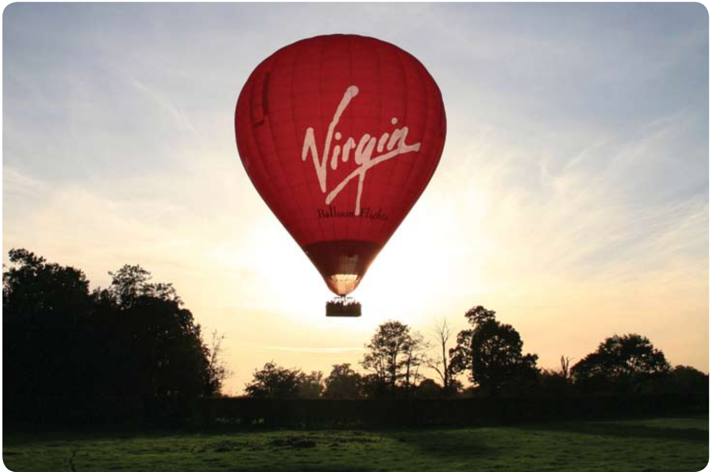
Virgin balloon flight at dawn